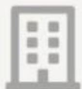
Mini Hall for functions