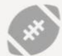
Play Ground and mini football pitch